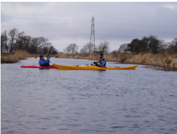
The canal proceeds through Garstang, passes the new housing estates and crosses the River

The day the final section was due to be paddled blessed us with uneventful weather - mild, dry, and dull with no wind. After meeting at the Hand & Dagger, organising the car shuttle and driving up to Garstang we were on the water just after 11am. We immediately encountered 'canal rage' as the driver (?) of a canal cruiser insisted he couldn't get through the bridge at the get-in as we were obstructing it. This was despite the member of our group nearest to him still being on the towpath. After showing off his reverse thrust and making a great deal of waves and noise he proceeded, much to the amusement of a passing dog walker, through the empty bridge, scraping the side of his boat along the canal bank on one side and with what looked like at least 10 feet to spare on the other.