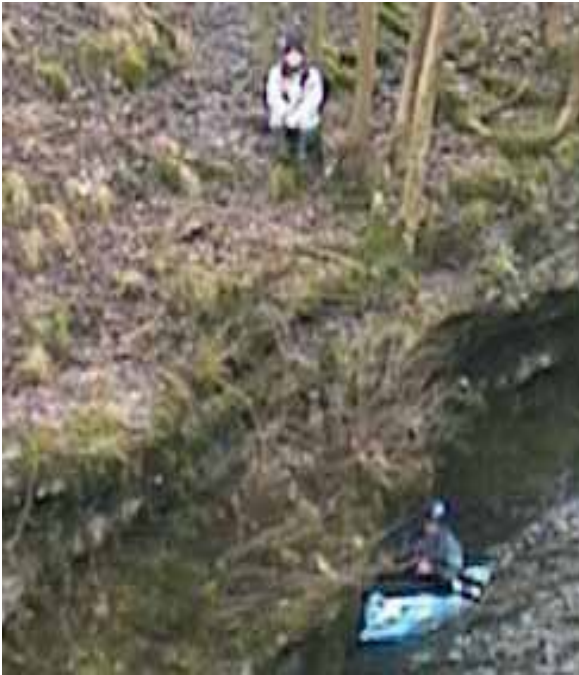
Who's that trip-trapping over my bridge?